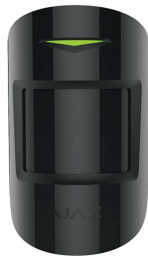
MotionProtect Wireless pet immune motion detector