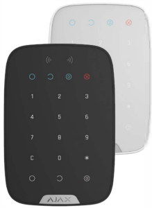
Keypad & Keypad Plus Two-way wireless keypad with option for RFID tags and passcards with the Keypad Plus.