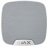
Internal Siren Wireless indoor siren.