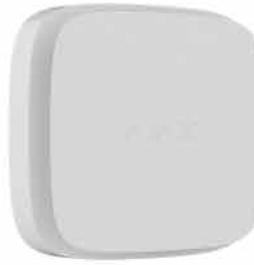
FireProtect 2 (Heat/Smoke) Heat and dual optical sensors detect smoke and filter out humidity, steam, dust, dirt and insects and with a 10 year sealed battery this device is virtually maintenance free.