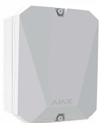
MultiTransmitter 3EOL 18 Zone module for connecting 3rd party wired detectors to an Ajax system and managing via the App. Supports NC, NO, EOL, 2EOL and 3EOL connections and auto detects EOL resistor values. Separate 12V power supply for hard wired smoke detectors.