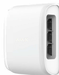
DualCurtain Outdoor The ultimate perimeter security to protect people and property. Two sided options allow you to accurately adjust 30 metres of the detection zone, reacts to intruders, screening out triggers like natural interference, pets and other animals.