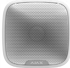
External Siren Wireless outdoor siren with strobe light.